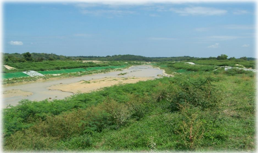
Linggi River, Negeri Sembilan