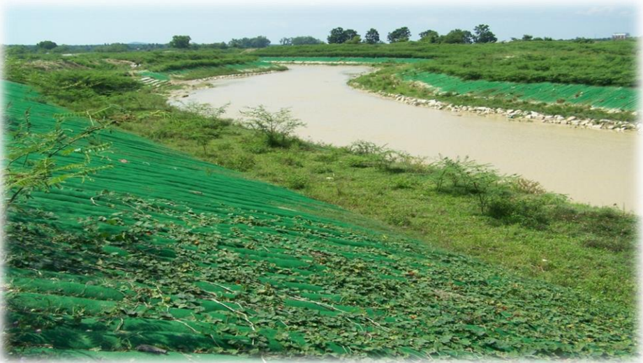
Linggi River, Negeri Sembilan